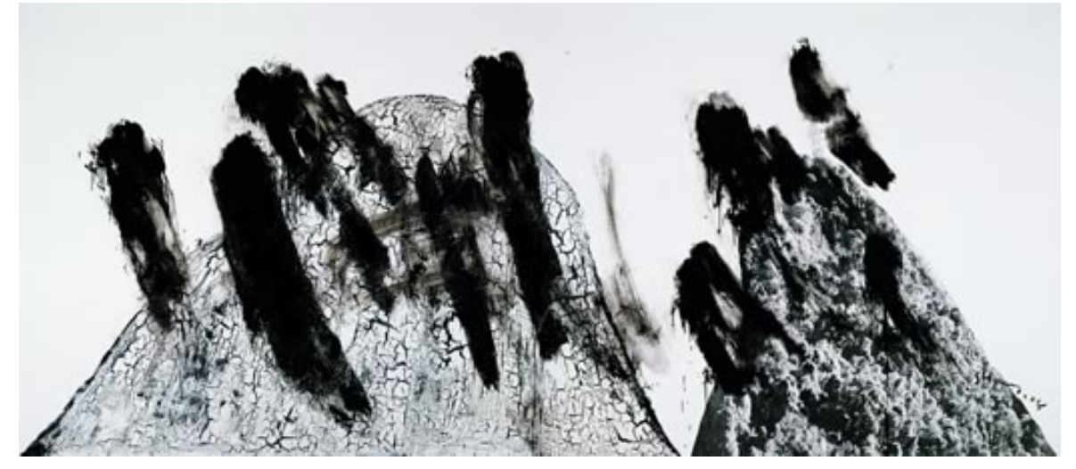
Fig.2 "Dong Qichang Project-2" by Shang Yang, 2003, Oil Painting, Spray Painting and Acrylic on Paper

Modern art seeks to create material through the search for calligraphy, conveying meaning through written strokes loaded with personal emotion. Examples include artists such as Kazuo Shiraga and Yuichi Inoue and Franzkline. In addition, the emergence of abstract painting marks a rejection of classical forms of painting, shifting painting from the reshaping of deep space back to the expression of flat space, committing to the visual purity to re-explore the language of painting and embody the subjectivity of vision. However, the high level of obsession with three-dimensional space in contemporary Chinese figurative painting has, on the one hand, limited the expressive power of painting to a certain extent, and on the other hand, the independence of the material itself tends to become a subordinate to line and colour, becoming a depiction devoid of creativity. In the context of contemporary art, the application of writing also presents a multi-dimensional vision, such as the form of writing, the presentation of brush and ink, and the spiritual connotation of writing. Such as Shang Yang's "Dong Qichang Plan" series, which is called the new representational painting. As shown in Figure 2. Combined with the abstract brushwork and texture of image writing, it creates symbols and diagrams that show the confluence of present and historical time factors.